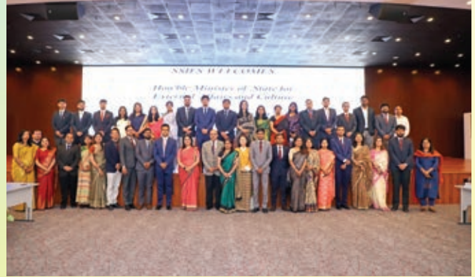
Call by IFS OTs on Minister of State for External Affairs & Culture, Smt. Meenakshi Lekhi