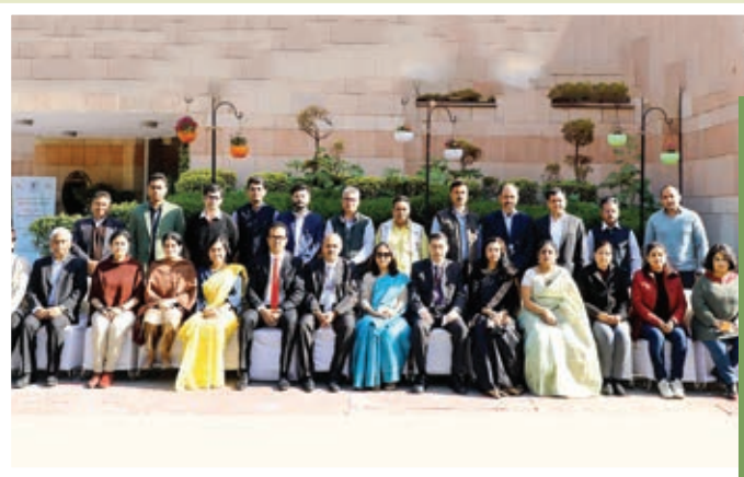
Participants of the Special Course on Foreign Policy for Indian Media

2022 by Smt. Reenat Sandhu, then Secretary (West), MEA. The Special Course included interactive sessions on MEA’s structure and functions, and relevant aspects of India’s foreign policy and diplomatic engagements around the world. Smt. Meenakshi Lekhi, Minister of State for External Affairs & Culture, was the Chief Guest at the Valedictory Ceremony held on 25 February 2022.