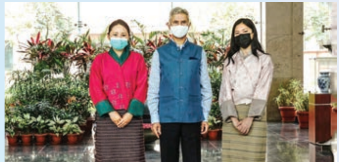
EAM with Bhutanese OTs