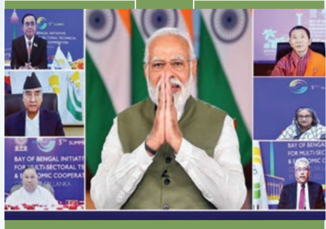
MoUs signed with BIMSTEC Member States