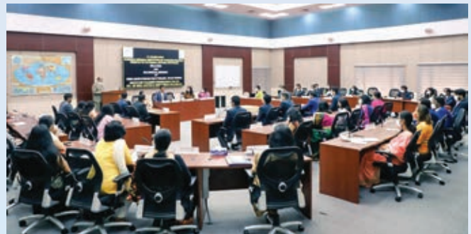
Welcome address by Dean (SSIFS)