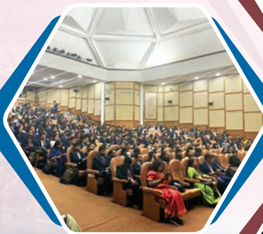
Participants at the 96 th Foundation Course