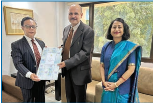
Presentation of mementos by Dean (SSIFS) and DG, Foreign Service Academy, Bangladesh