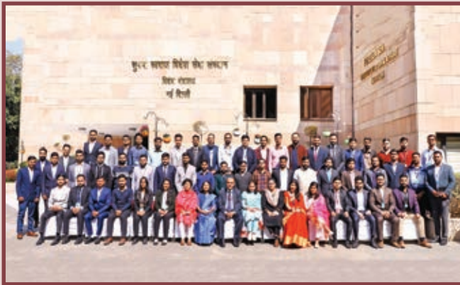
Participants of ITP for Batch-II of DR-ASOs

and drafting, forms of official communication, Conduct Rules, IFS PLCA, gender sensitization, office etiquette, dress code etc. In addition, there were a few sessions on India's culture, polity, economy and globalization, foreign policy, ITEC, Development Partnership Cooperation, Indian Diaspora and emotional intelligence. The programme concluded with a session on Heartfulness Yoga to promote long-term general well-being. The Valedictory Session was held physically at SSIFS during which Certificates of Participation were given to the ASOs. They were invited for a valedictory lunch as a culmination of the ITP.