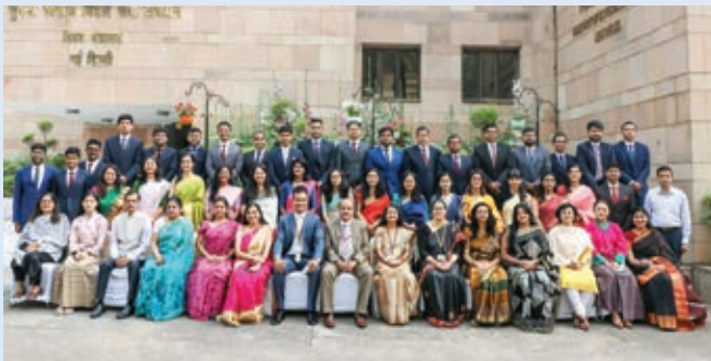
IFS OTs 2021 Batch with Team SSIFS

the IFS OTs and Bhutanese diplomats called on External Affairs Minister, all three Ministers of State (External Affairs), Foreign Secretary and all the other Secretaries of MEA. The officers also attended sessions on India's foreign policy conducted by academicians and domain experts, and sessions on structure and function of the Ministry and other administrative matters conducted by officers from MEA.