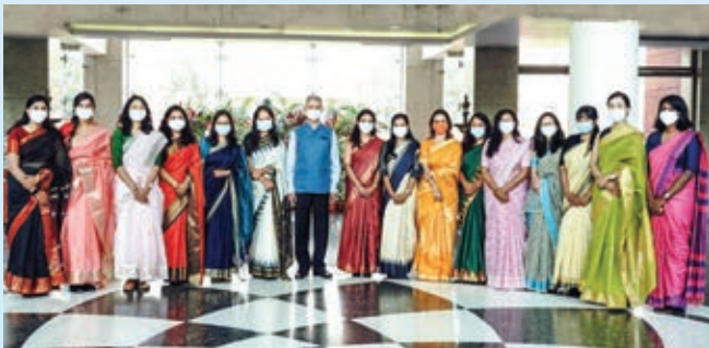
EAM with women IFS OTs 2021 Batch