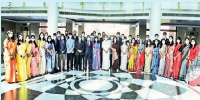
Call by IFS OTs on Minister of State for External Affairs & Parliamentary Affairs, Shri V. Muraleedharan