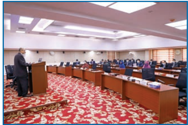
Address by Dean (SSIFS)