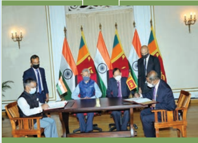
MoU signed with Sri Lanka