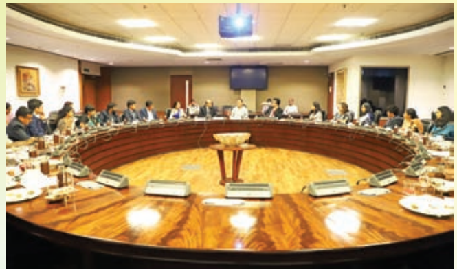
Call by IFS OTs on Minister of State for External Affairs & Education, Dr. Rajkumar Ranjan Singh