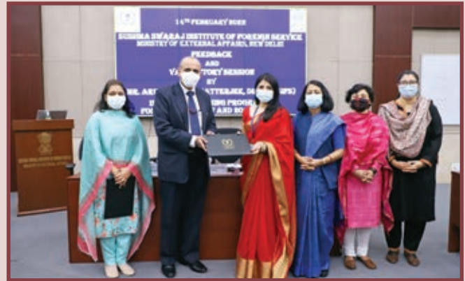
Valedictory Session of ITP for Batch-II of DR-ASOs