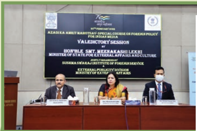
Minister of State for External Affairs & Culture, Smt. Meenakshi Lekhi graced the Valedictory Ceremony